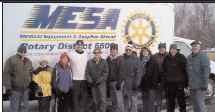
Pictured is the crew who loaded bed parts on the truck at Admiral's Point.